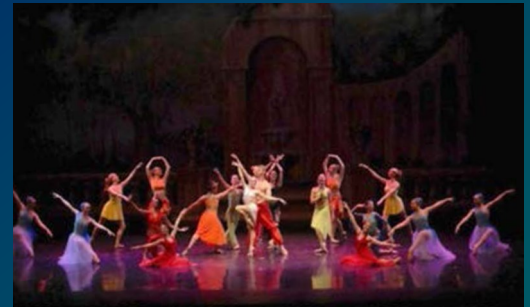
The Grossmont Symphony Orchestra performed the music at the San Diego Ballet production of “Seven Beauties.”