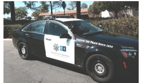
Patrol cars assigned to the District now display the District logo on the doors alongside the Sheriff's Department logo.